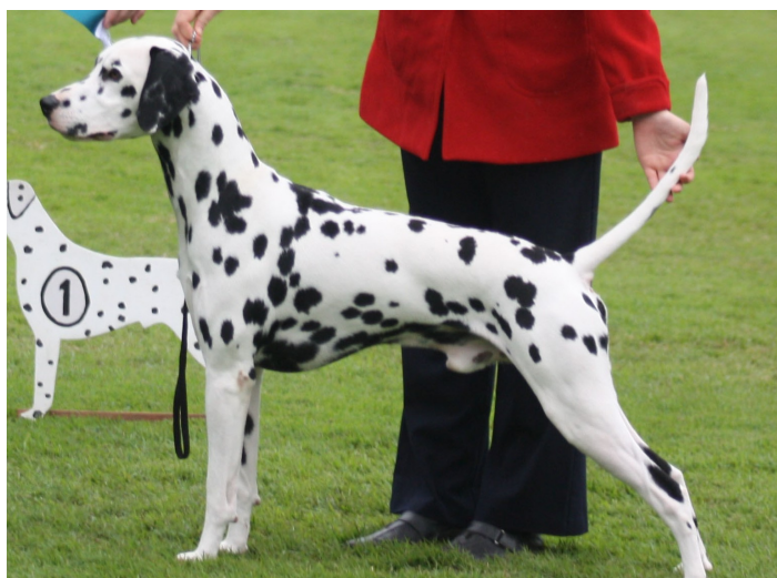
Property Class—Best Topline and Tailset: Lykatyga Dark Crystal