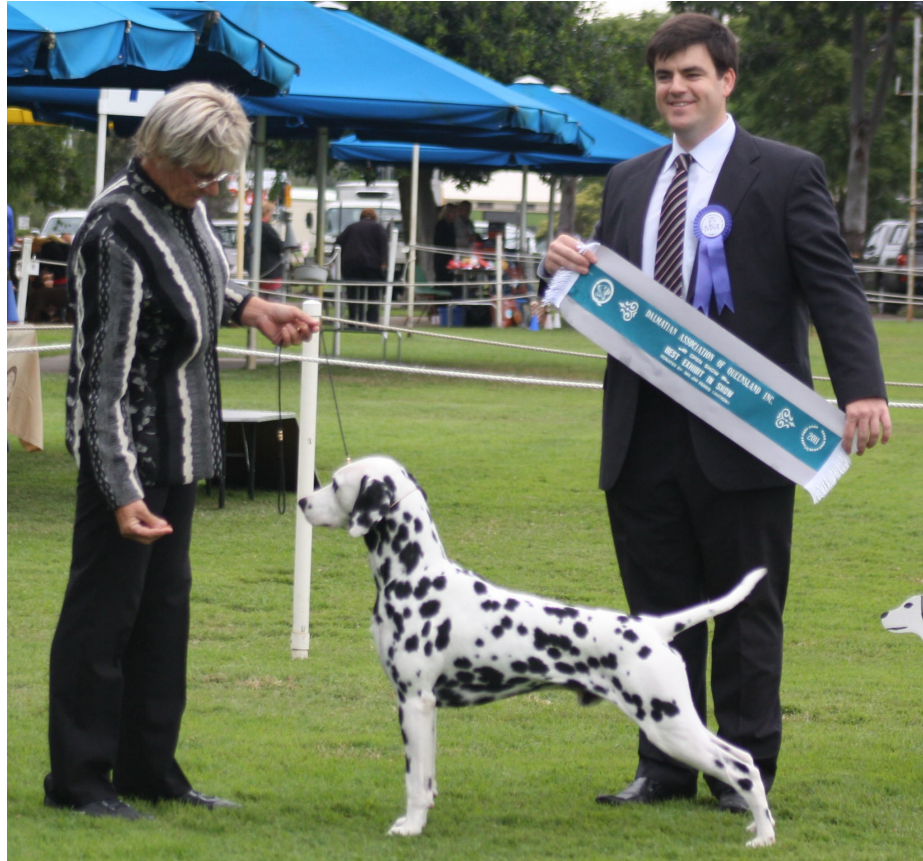
Best In Show— Ch Paceaway Atrosemount