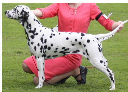
Right: Opposite Open in Show—Gr Ch Paceaway Rum Ruffian