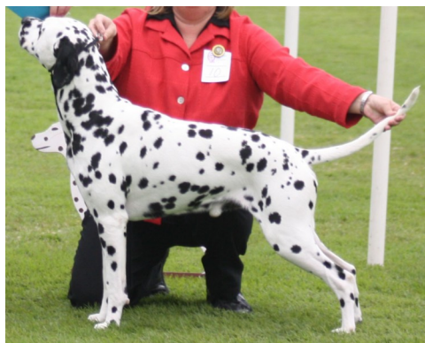
Right: Opposite Aust Bred in Show Zamashom Knight Watch