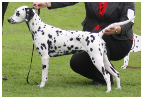
Below: Opposite Puppy in Show Lotzadotz Phancy That