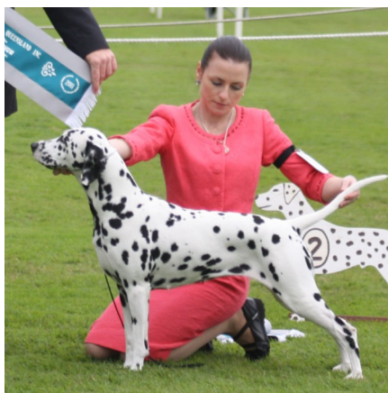
Left: Best in Show and Best Intermediate in Show Ch Paceaway Atrosemount