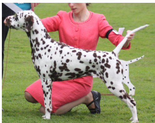
Best Junior in Show: Ozzispot Sinners N Shadows