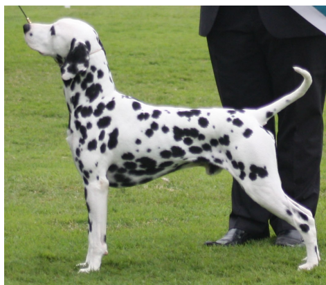
Right: Opposite Intermediate in Show Lotzadotz Razzle Bedazzle