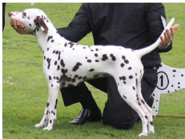
Property Class—Best Spotted: Retma Sunset Boulevard