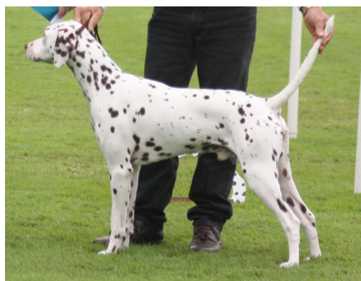
Opposite Junior in Show: Lotzadotz Bobby Dazzler