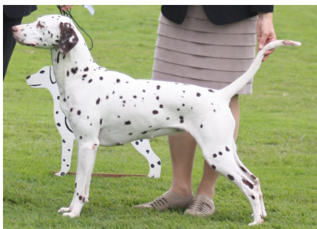
Property Class—Best Gaited: Ch Varewell White Topaz