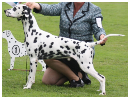
Left: Best Puppy in Show Paceaway Ona Mission