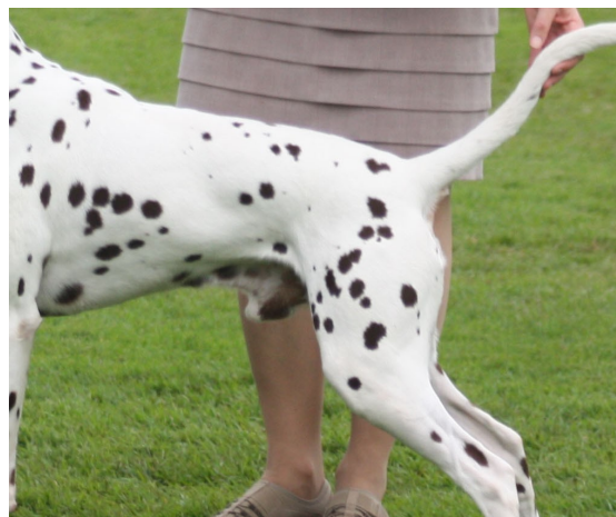
Property Class—Best Hindquarters: Ch Varewell White Topaz