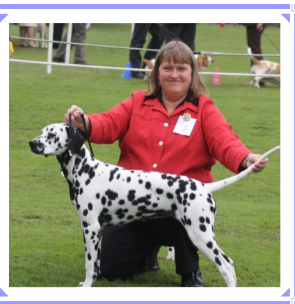
Left: Best Minor Puppy in Show Paceaway Wild Oats