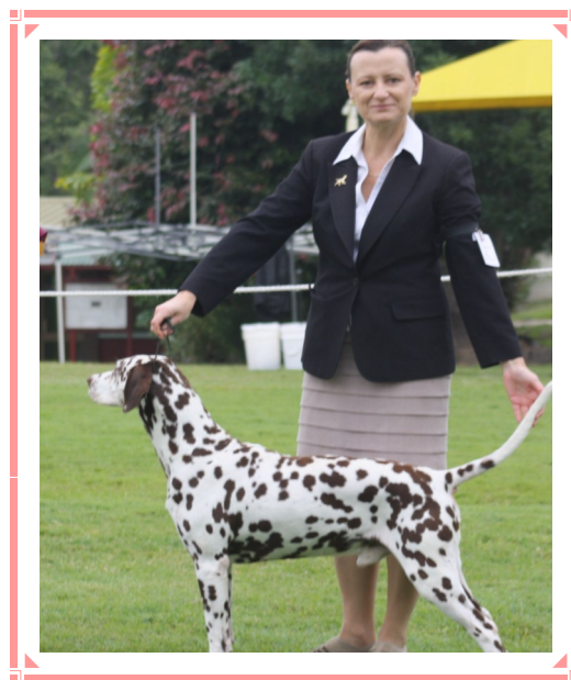
Right: Best Veteran in Show Ch Varewell Excalibur

The DAQ was established in 1973 with the aim of promoting responsible ownership & breeding of pedigree Dalmatians, membership is open to all who love the spotted dog whether they own one, many or not.