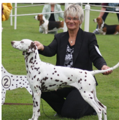
Left: Runner up to Australian Bred in Show Gr Ch Paceaway Nite Fire