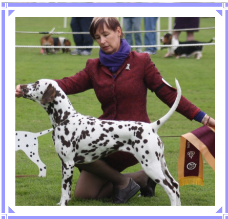
Left: Best in Show and Best Open in Show Ch Topspott Cherry Brandy