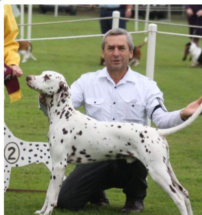
Left: Best Junior in Show Ozzisport Sinners N Shadows