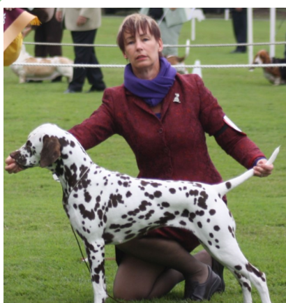
Right: Runner up Best Intermediate in Show Ozzisport Xtreme Addiktion