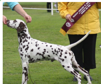
Right: Runner up to Best Open in Show—Gr Ch Paceaway Rum Ruffian