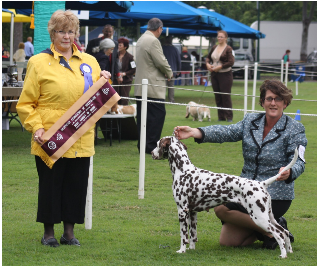
Best In Show— Ch Topspott Cherry Brandy