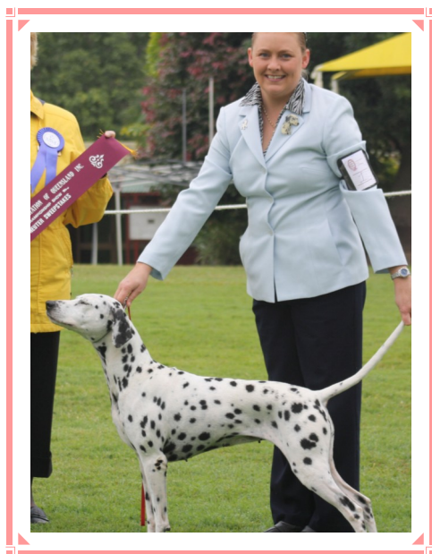
Left: Best Neuter in Show Ch Throdice in Fashion