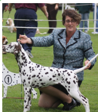
Right: Runner up to Best Puppy in Show Paceaway Ona Mission