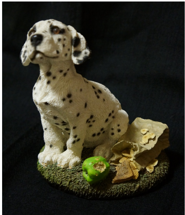
Living Stone Inc USA Dalmatian & lunch bag