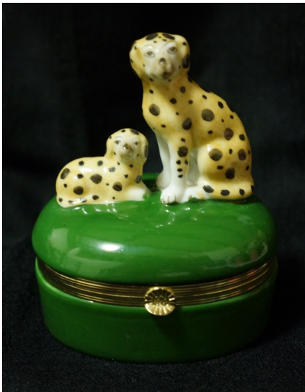
Fritz & Floyd trinket box