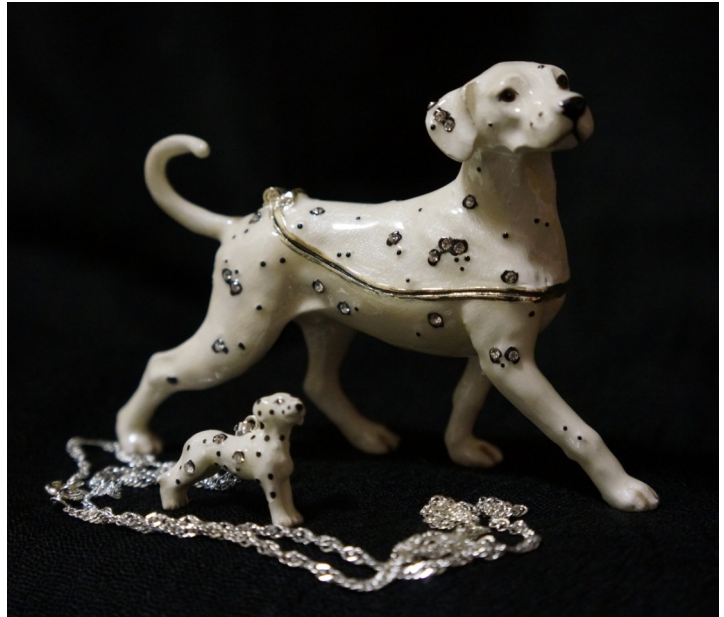
Kingspoint Designs Dalmatian Limogue Box and Matching Pendant