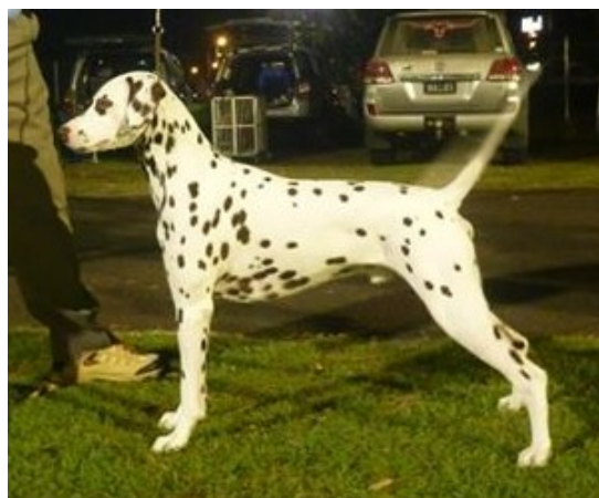
Liteflite Buckshot Blue

Reserve Challenge Bitch & Runnerup to Best of Breed - Paceaway Xclusive Ticket