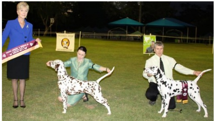
Opp Sex Aust Bred Ch Ozzisport Xtreme Addiktion