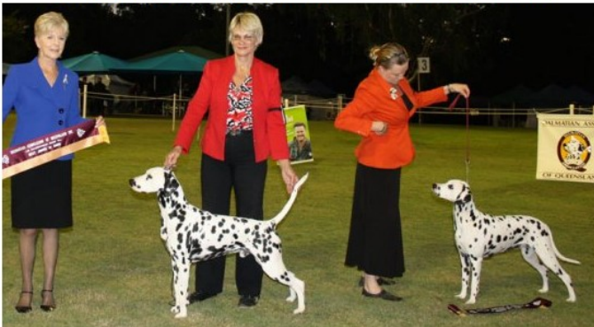
Opp Sex Junior Lykatyga Ima Hottie