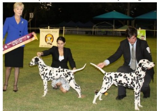
Opp Sex Puppy Paceaway Remington