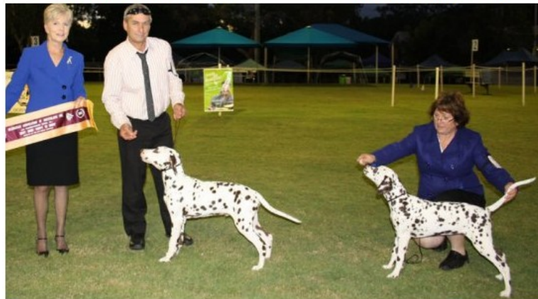
Opp Sex Baby Lotzadotz Liquid Amber