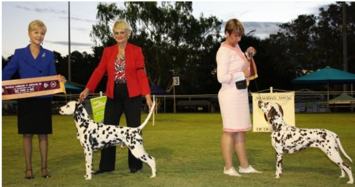
Res and Opp Sex in Show Ch Brewen Kandy Kar