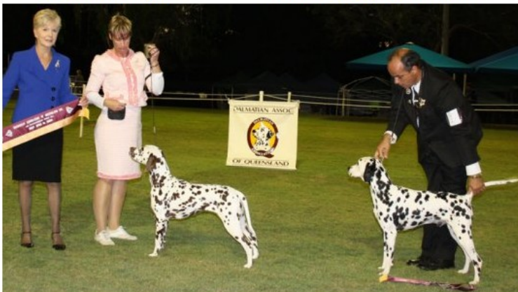
Opp Sex Open Gr Ch Paceaway Kiwi Konexon