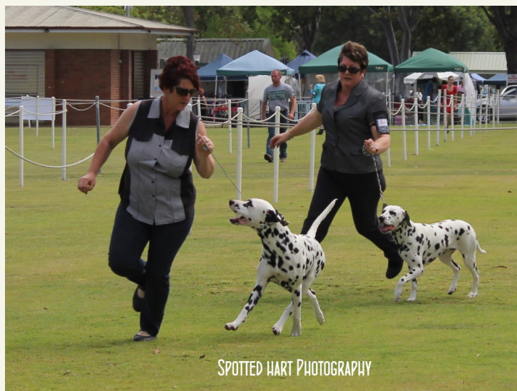
SPOTTED HART PHOTOGRAPHY