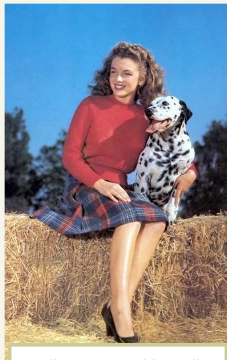
Marilyn Monroe with a Dally.

While we are still on the topic of the National, in this issue you will find the results and also the conformation judges critique.