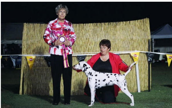
Intermediate in Show - Spintaway Arrabella