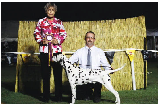
Veteran in Show - Gr Ch Brewen Masta O Ceremony