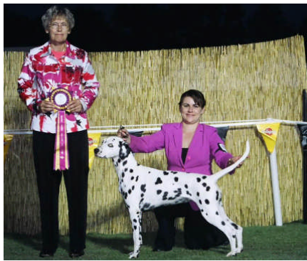
Open in Show - NZ Ch Rothkeal Flash Storm at Paceaway