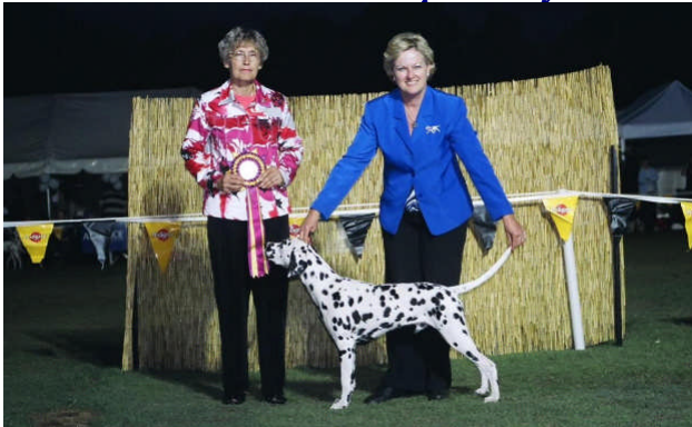
Minor Puppy in Show - Starswept Eskimo Prince