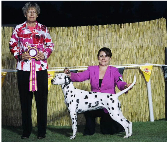
Best in Show - NZ Ch Rothkeal Flash Storm at Paceaway