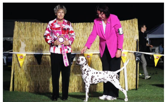
Opposite Sex Intermediate in Show - Ch Paceaway Tuff Justice