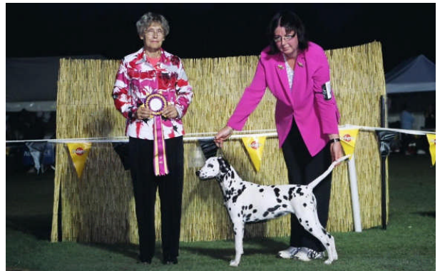
Opposite Sex Minor Puppy in Show - Paceaway Kold Komfort