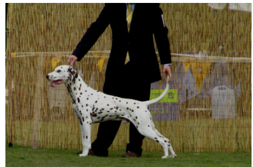
Opposite Sex Open in Show - Ch Dalridge Philosfrs Stone