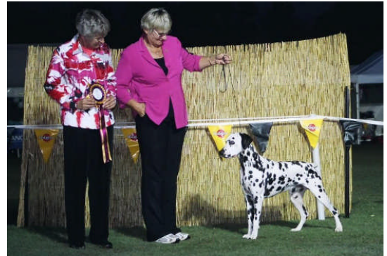
Opposite Sex Aust. Bred in Show—Ch Paceaway Kiwi Konexon