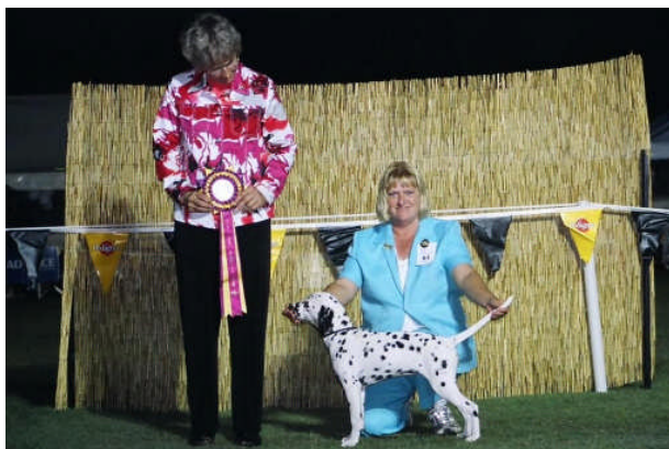
Baby Puppy in Show - Zamashom Eskimo Joe