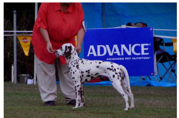
Neutered Sweepstakes - Lukius Above Nbeyond