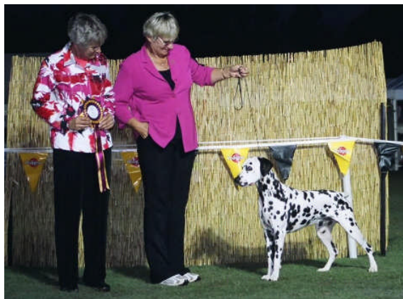
Opposite Sex to Best in Show - Ch Paceaway Kiwi Konexon