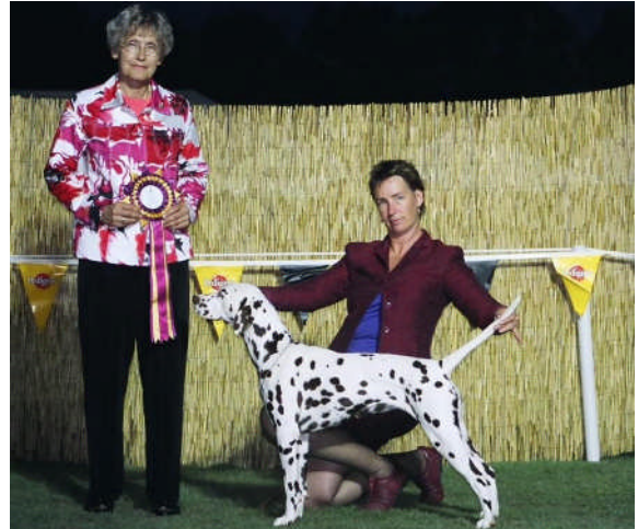
RunnerUp to Best in Show - Ch Brewen Glamour Girl