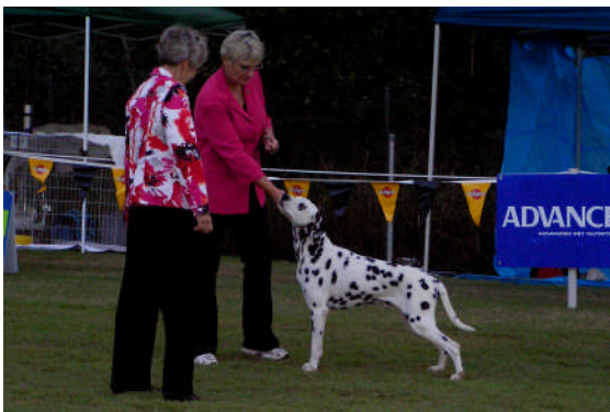
Special Veteran Sweepstakes - Ch Paceaway Greased Litenin