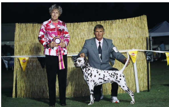
Junior in Show - Ch Paceaway Rum Ruffian