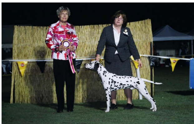
Puppy in Show - Dallsports Kid Kermit