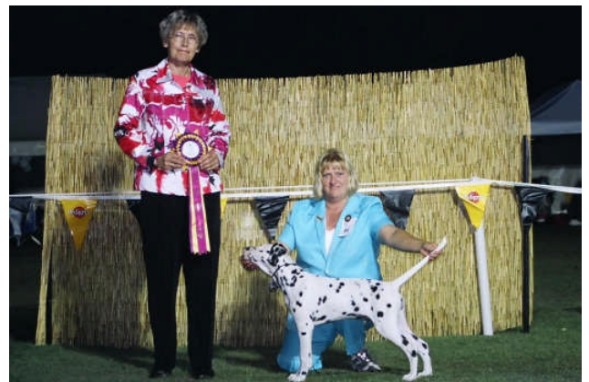
Opposite Sex Baby Puppy in Show - Zamashom Cotton Eyed Joe