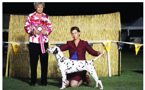
Opposite Sex Junior in Show - Dumbledeer Winsome Waze