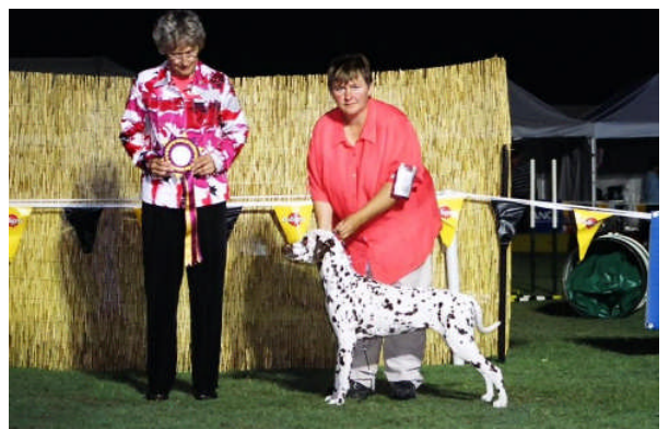
Opposite Sex Puppy in Show - Lukius Solar Flare