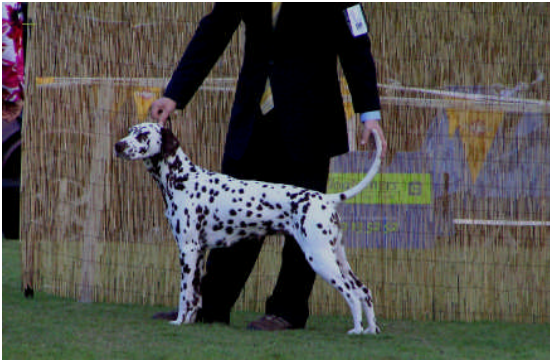
Aust. Bred in Show - Ch Gemcourt Plays with Fire