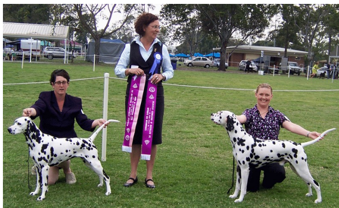
RIGHT RUNNER UP TO BEST INTERMEDIATE IN SHOW - LYKATYGA DARK CRYSTAL