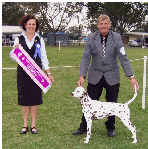
RUNNER UP TO BEST IN SHOW - CH PACEAWAY NITE FIRE