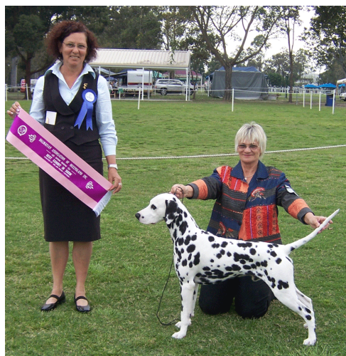
BEST IN SHOW - PACEAWAY ATROSEMOUNT