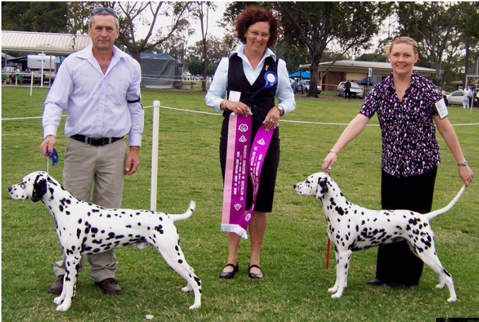
LEFT BEST AUST BRED IN SHOW - CH DALLASPOT KID KERMIT