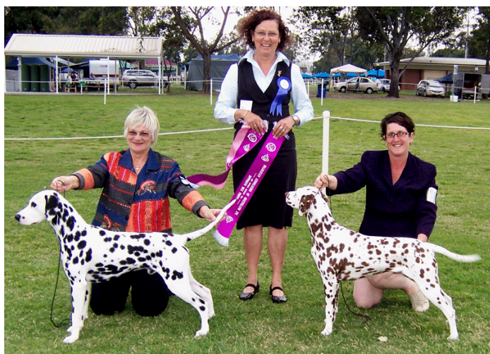
LEFT BEST PUPPY IN SHOW - PACEAWAY ATROSEMOUNT