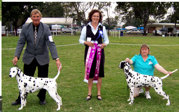
LEFT BEST INTERMEDIATE IN SHOW - CH PACEAWAY FAIRYTALES