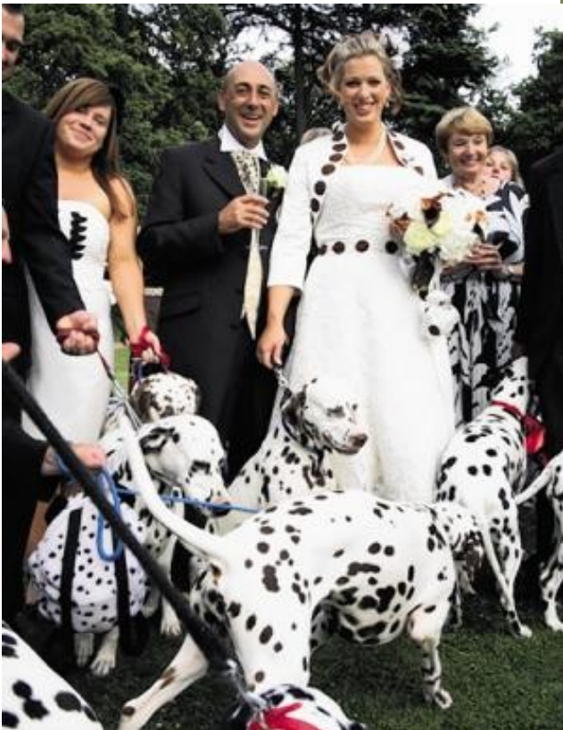
Editor—no one we know, just another Dalmatian enthusiast!