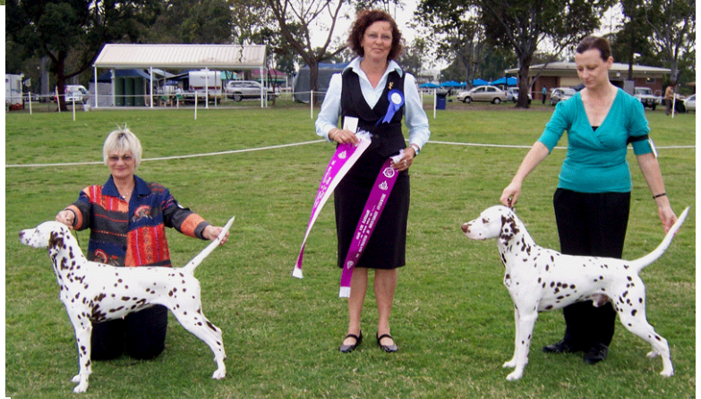
RIGHT RUNNER UP TO BEST OPEN IN SHOW - CH VAREWELL WHITE TOPAZ