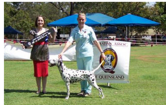
Australian Bred in Show - Ch Throdice In Fashion Opposite Sex - N/A