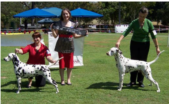
Puppy in Show - Paceaway Fairytales Opposite Sex - Varewell White Topaz