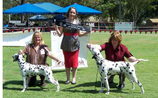
Minor Puppy in Show - Zamashom Eskimo Joe Opposite Sex - Zamashom Cotton Eyed Joe