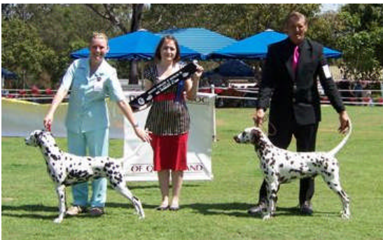
Intermediate in Show - Lykatyga Wyld Streak Opposite Sex - Ch Paceaway Rum Ruffian