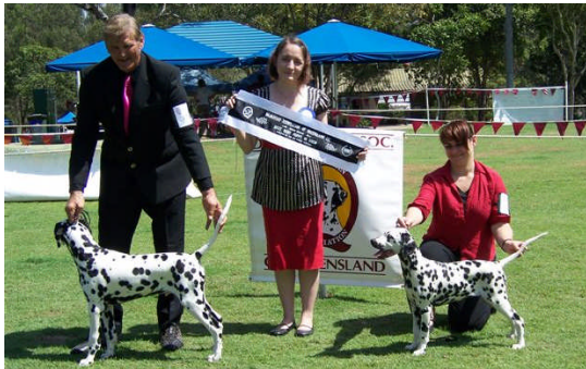
Baby Puppy in Show - Paceaway Kando Kahryzma Opposite Sex—Paceaway Foreign Affair