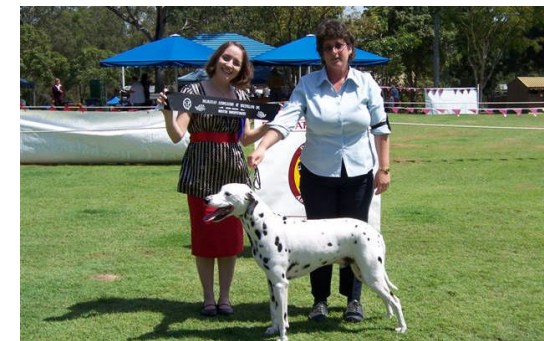
Neutered in Show - Throdice In Trigue