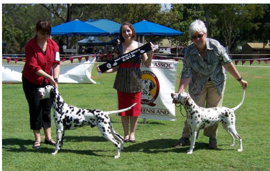
Open in Show - Ch Kiwi Konexon Opposite Sex - Throdice Court of Law