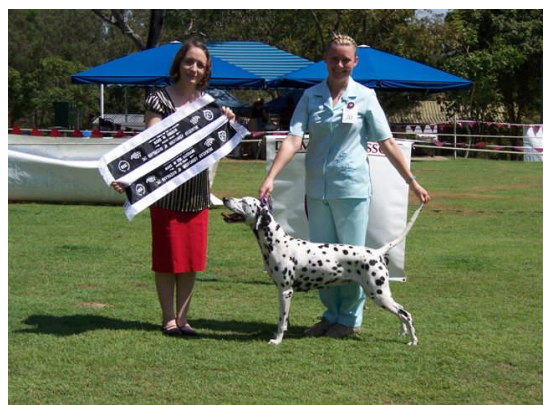
Reserve in Show - Ch Throdice In Fashion