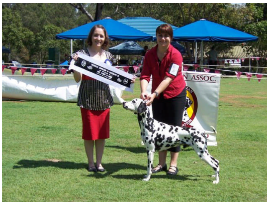
Best in Show - Ch Paceaway Kiwi Konexon