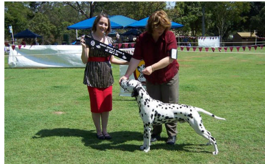
Junior in Show - Dallasots Kid Kermit Opposite Sex - N/A