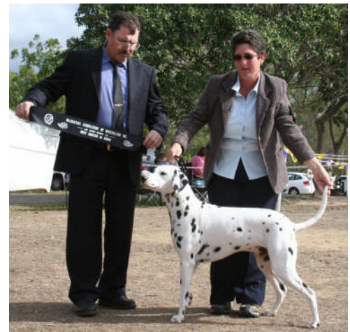
Best Veteran in Show - Ch Varewell Dream Maker