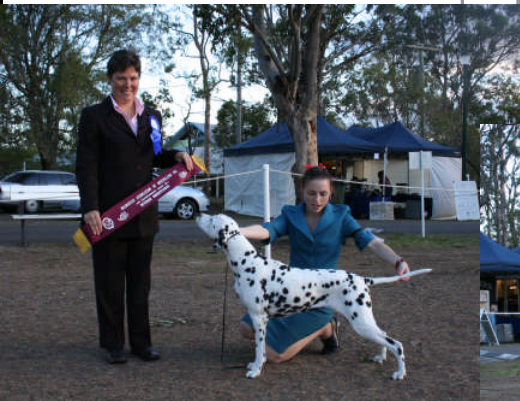
Best Neuter - Throdice Intrigue

Best Veteran - GrCh Ozzisport Brewen Wicked Waze