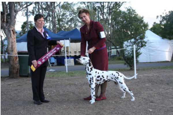
Best Intermediate in Show - Ch Brewen Glamour Girl