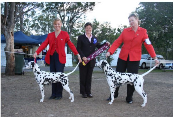
Best Puppy in Show - Lykatyga Wyld Streak Opposite - Lykatyga Wyld Midnite