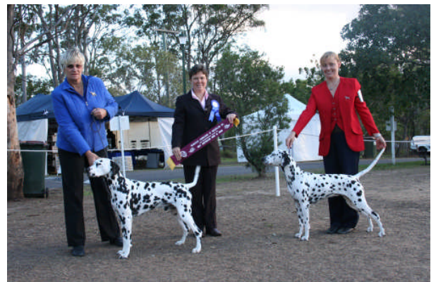
Best Aust Bred in Show - Paceaway Kiwi Konexon Opposite - Ch Throdice In Fashion