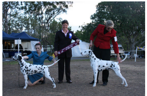
Best Junior in Show - Ozzispot Tyme to Shine Opposite - Lendalbas Blk Qui Arras