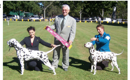
BOIS - NZ Ch Charizelle Capitain Morgan Op.sex - Ch Brewen Glamour Girl