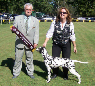
BMPIS - Lotzadotz Razzle Bedazzle