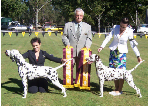
BIS - NZ Ch Charizelle Captain Morgan RUBIS - Ch Ozzisport Truble Inthemist