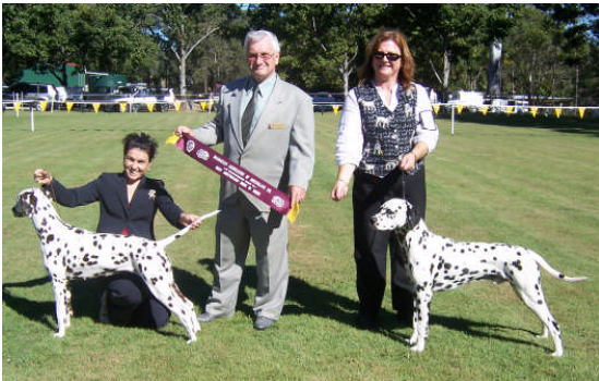
BABIS - Ch Ozzisport Truble Inthemist Op. sex - Dallaspots Kid Kermit