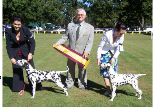
BPBIS - Dallaspots Candy Cane Op. sex - Ozzisport Strictly T Xtreme