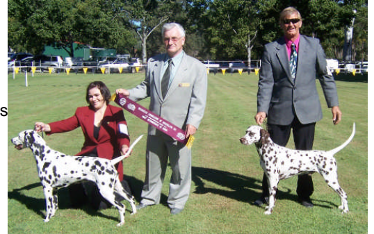
BIIS - Ch Paceaway Fairytales Op. sex - Ch Paceaway Rum Ruffian