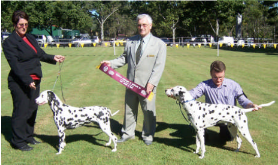
BJIS - Paceaway Kando Kalypso Op. sex - Retma Valentino