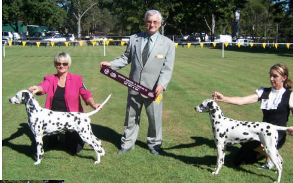
BPIS - Paceaway Malibu Op. sex - Dilldale Marilyn Monroe