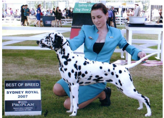
Ozzisport Tyme to Shine