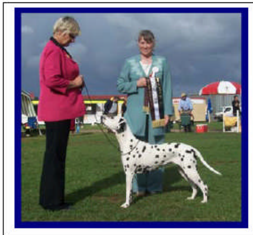
Ch. Phidgity Potent Potion (Imp.U.K.)