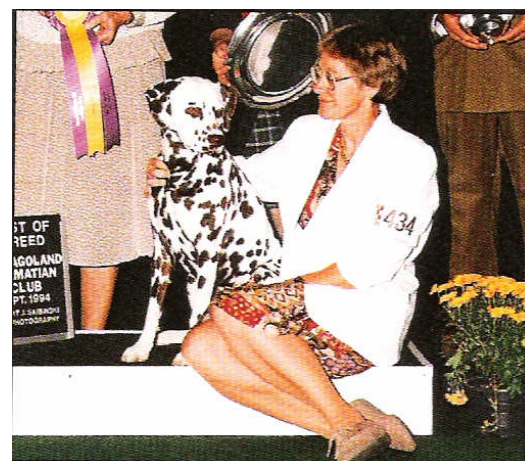
Am-Can CH Paisley Pointblank (L) "Morris"

Sire CH Paisley A Change of Pace, CD and Dam CH Royal Oaks Liberty Belle