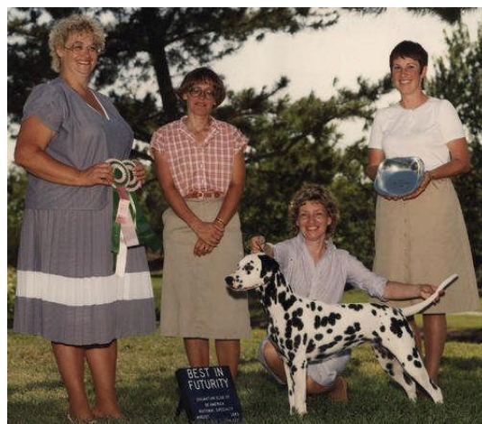
CH Rambler Quintessence, CD, TT, CGC "Quinn"

Pictured at 9 months, winning Dal Club of America Futurity under breeder judge