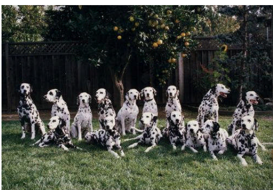
16 obedience titled Dals, including 9 who are also Champions, pose for a group photo. All are Rambler owned, bred, or related.