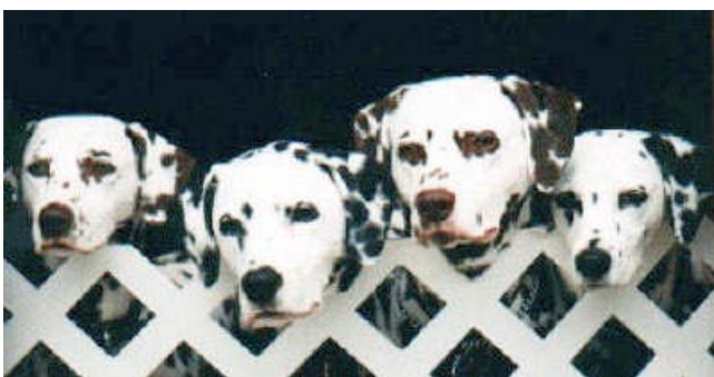
Am/Can Ch. Paisley N Tucks Eureka (L) "Eloise" - Mo's dam, Am/Can Ch. Long Last Perfect For Paisley CD "Robert" - Mo's sire, Am/Can Ch. Paisleys Pointblank (L) "Morris", Am/Can Ch. Paisleys Cause Celebre CD "Marla" - Mo's sister.